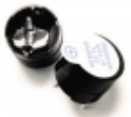
12mm x 9.5mm active buzzer 5V SG$0.60

Makeblock TT Geared Motor DC 6V/200RPM is the new power source with plastic gears in Makeblock platform. This TT Geared Motor fits perfectly with Makeblock Plastic Timing Pulley 90T for the wheels system of DIY items. It can be used in Makeblock mBot as [Product Details...]