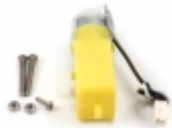
TT Geared Motor DC 6V/200RPM - mBot SG$7.70

This is a coin cell holder for the common CR2032 type battery. [Product Details...]