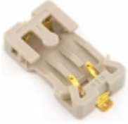
Coin Cell Battery Holder - 20mm (Sewable) SG$2.20

â€¢Compatible with Xilinx Platform Cable USB - programs all XilinxÂ® devices â€¢Interfaces with 5V, 3.3V, 2.5V, 1.8V and 1.5V systems â€¢Compatible with Full-Speed and Hi-Speed USB ports â€¢Requires Xilinx iMPACTâ„¢ software for programming and configuration [Product Details...]