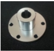
12MM KEY MOUNTING HUB FOR MECANUM AND OMNI WHEEL SG$19.50

These high quality universal Aluminum hubs are key-locked and loctited to the motor shaft. They are designed to connect a motor and a wheel. There is a groove of key locked for securing a motor to the hub.