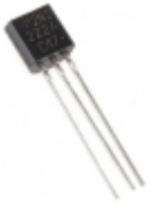
Transistor - NPN (P2N2222A) SG$1.20

This is the P2N2222A, an NPN silicon BJT. This little transistor can help in your project by being used to help drive large loads or amplifying or switching applications. The P2N2222A is specifically rated at 40V and 600mA max. [Product Details...]