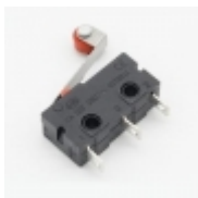
Mini Limit Switch - SPDT (with Roller) SG$1.50

This is a 10-pin socket with 2mm pitch that mates with the popular XBee radio from Maxstream. Use this small part to avoid having to solder your precious radio to a PCB. You'll need two of these sockets to connect to all 20 pins on the XBee. [Product Details...]