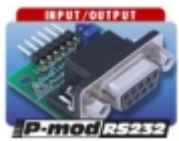
PmodRS232 - Serial converter & interface SG$30.80

Pmod RS232 converts between digital logic voltage levels to RS232 voltage levels using the Maxim Integrated MAX3232 transceiver. [Product Details...]