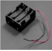
6xAA Battery Holder(double layer) SG$2.70

This battery holder can hold 6 AA battery which can make 7.2 V rechargeable battery pack from NiMH / NiCd cells or 9V battery pack from alkaline cells. It comes with a Red & Black Wires with side by side & stack connection. [Product Details...]