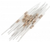
Resistor 100 Ohm 1/4 Watt PTH - 20 pack SG$2.00

This 10K trimmable potentiometer has a small knob built right in and it's™s breadboard friendly to boot! Perfect for your next LCD contrast adjuster, opamp setting, or volume level. This model # is TSR-3386U within the datasheet. [Product Details...]