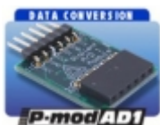
PmodAD1 - Two 12-bit A/D inputs SG$47.70