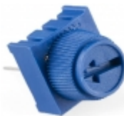
Trimpot 10K with Knob SG$0.95

This is a standard 12mm square momentary button. What we really like is the large button head and good tactile feel (it "clicks"™ really well). This button is great for user input on a PCB or a good, big reset button on a breadboard. Breadboard friendly! [Product Details...]