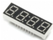
7-Segment Display - 4-Digit (Red) SG$1.80

This is a 3-terminal microswitch, each equipped with a roller lever actuator. This switch has a great 'clicky' sound to it with a nice tactile feel and is perfect when used for a slider, 3D printer, or robot project. Each microswitch is rated for 5A at 25 [Product Details...]