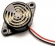
High Decibels Alarm / continuous sound / buzzer DC3-24V Black SG$0.95

This 9V battery holder allows your battery to snap in tight and holds it in place, which is great in situations where you don't want the battery just hanging. It also has three mounting holes so you can attach it securely to your enclosure. It comes with [Product Details...]