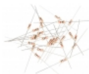
Resistor 1K Ohm 1/4th Watt PTH - 20 pack SG$2.00

This is a basic, 4-digit 7-segment display - red in color. It has a common anode. The display features one decimal point per digit, and individually controllable apostrophe and colon points. [Product Details...]