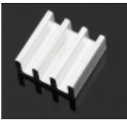
Heat Sink 11x11x5.5 Silver SG$0.50

A heat sink is a passive heat exchanger that cools a device by dissipating heat into the surrounding medium.