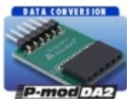
PmodDA2 - Two 12-bit D/A outputs SG$34.00

Pmod RS232 converts between digital logic voltage levels to RS232 voltage levels using the Maxim Integrated MAX3232 transceiver. [Product Details...]