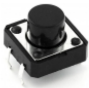
Momentary Pushbutton Switch - 12mm Square (10 pcs / pack) SG$1.50

This is the P2N2222A, an NPN silicon BJT. This little transistor can help in your project by being used to help drive large loads or amplifying or switching applications. The P2N2222A is specifically rated at 40V and 600mA max. [Product Details...]