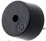
9mm Electromagnetic Buzzer: 40dB, 4-6V, Top Opening SG$2.50

This battery holder can hold 6 AA battery which can make 7.2 V rechargeable battery pack from NiMH / NiCd cells or 9V battery pack from alkaline cells. It comes with a Red & Black Wires with side by side & stack connection. [Product Details...]