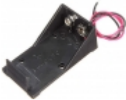
9V Battery Holder Box Case SG$2.50

This electromagnetic transducer is a compact way to add sound to your embedded project: just supply it with a PWM signal at 4 V to 6 V and it will produce sound at the frequency of the supplied signal from an opening on the top. [Product Details...]