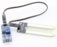
Soil Moisture sensor SG$2.50

This sensor works by having a series of exposed traces connected to ground and interlaced between the grounded traces are the sensor traces. The resistor will pull the sensor trace value high. [Product Details...]