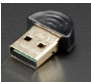
Bluetooth 4.0 USB Module (v2.1 Back-Compatible) SG$19.70

Add Bluetooth capability to your computer super fast with a USB BT 4.0 adapter. This adapter is backwards compatible with v2.1 and earlier, but also supports the latest v4.0/Bluetooth Low Energy. Inside lies a CSR8510 Bluetooth USB host. [Product Details...]